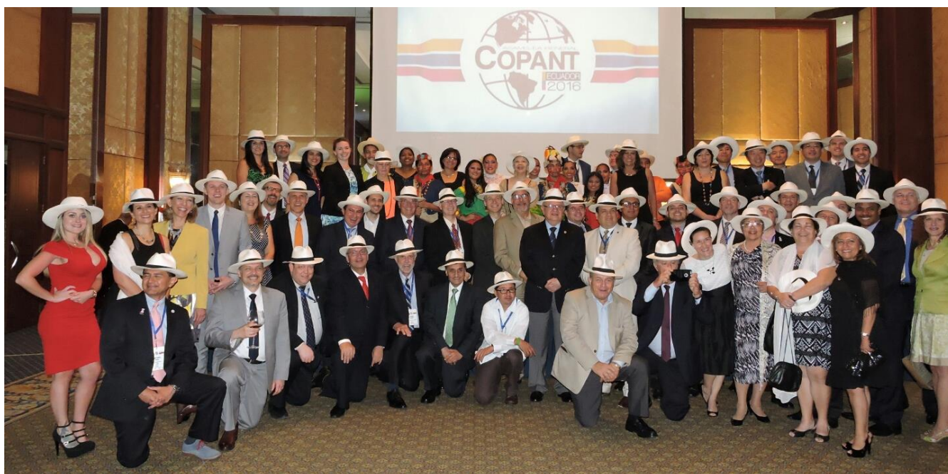
Delegates who attended the 2016 COPANT week at the gala dinner hosted by INEN

The meeting was attended by 80 delegates representing 23 active members, 7 adherent members, 5 international and regional organizations and 2 guests bodies. Follow the posts of the event at @COPANTNormas & #COPANT2016 .