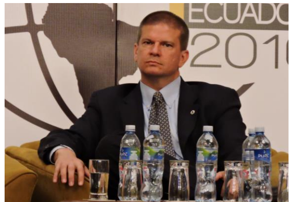
Jim Blubaugh, U.S. Environmental Protection Agency